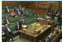
1,500 Military Jobs to Be Lost